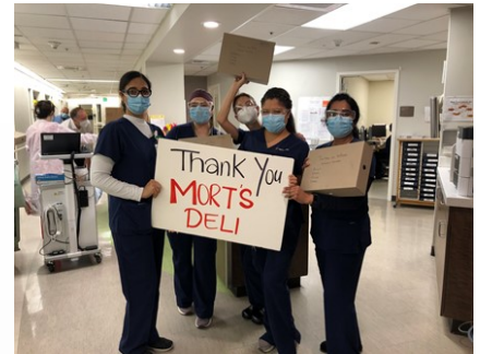
Mort's Deli owner personally delivers lunch to the staff