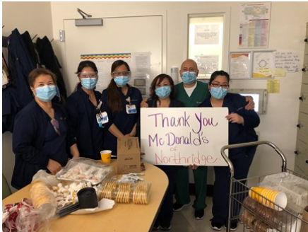
McDonald's of Northridge donates breakfast