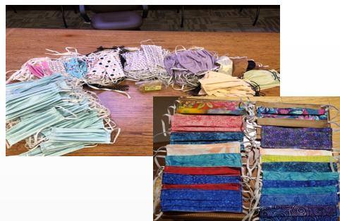
Community Members donate over 400 handmade masks