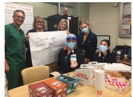
Dunkin' Donuts, Northridge