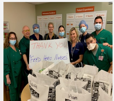
"Feed Hero Nurses" Organization provides ED & Trauma staff with dinner

Thank you to our wonderful community for showing your humankindness!