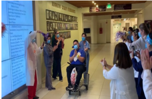
"Pause for Applause," in which staff celebrate the recovery of COVID-19 patients who are escorted through the hallways of the hospital for discharge.