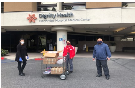
Chow King, North Hills sends over lunch