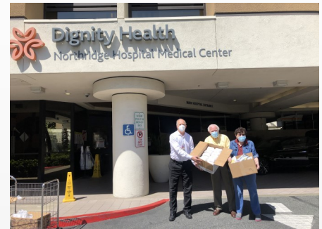
Granada Hills Rotary Club provides lunch