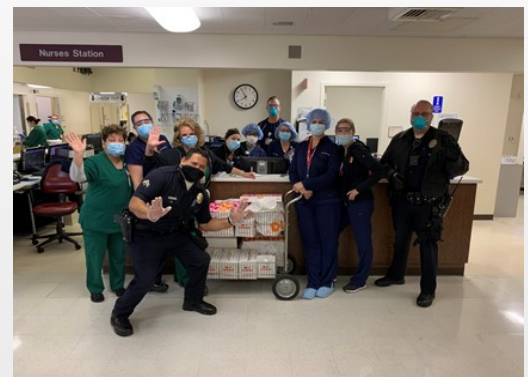
LAPD Devonshire Police Station delivers coffee & donuts